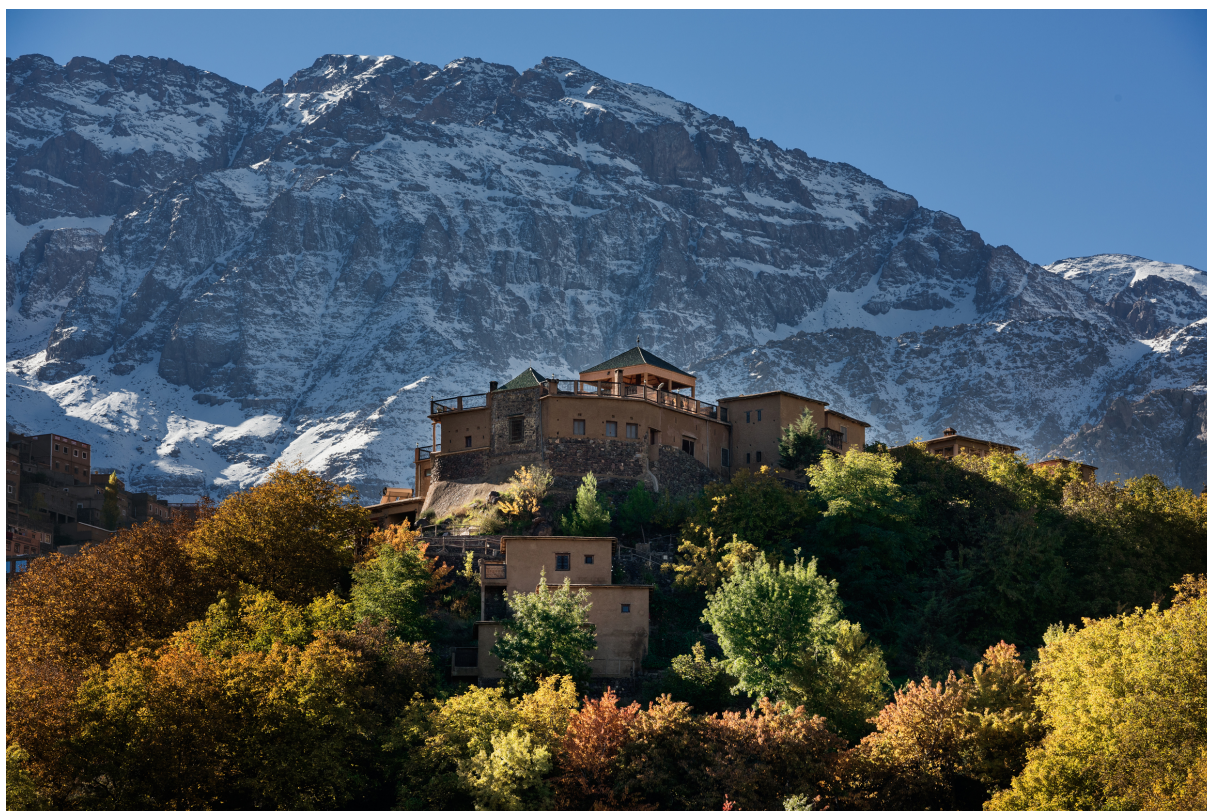
Kasbah du Toubkal on the outskirts of Imlil with Jbel Toubkal and the High Atlas Mountains in the background

The growth of tourism, once largely concentrated in the cities, is now affecting Moroccan life in many parts of the country. The King and the Tourism Ministry are actively encouraging tourism in rural areas such as the High Atlas. Imlil is the gateway to the Toubkal National Park containing the trekking magnet of Jbel Toubkal which, at 4,167 metres, is the highest peak in North Africa. In common with much of Morocco, Imlil is a colourful, dynamic and purposeful place where people from a variety of backgrounds and different nationalities work and live together in harmony.