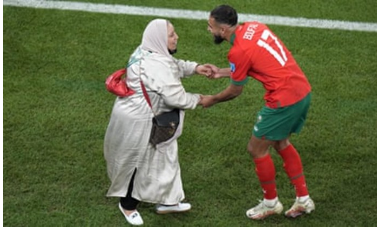
Morocco's Sofiane Boufal celebrates with his mother after his team's historic win over Portugal.

Morocco made joyful history on Saturday, playing a phenomenal game against Portugal, when they became the first African team to make it to the semi-finals of the World cup. They played it in a truly Moroccan way - they defended with supreme togetherness and passion, surged on with guts, determination and a spirit that resounded around the stadium as their every kick was cheered on by their supporters...then celebrated by bringing their mum's onto the pitch to dance. We cant wait for Wednesday's game against France. Oh to be in Marrakech or the High Atlas on Wednesday!