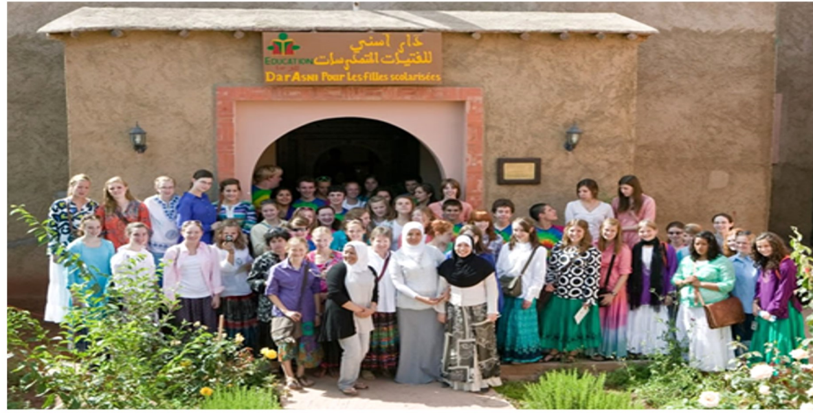
Anima, one of North America's Leading Children and Youth Coral Organisations, and the Girls from Asni's Education for All Boarding House.